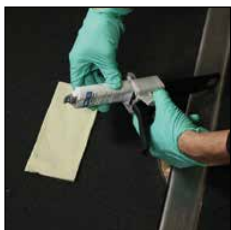
7. Wear chemical resistant safety gloves and assemble the pump.