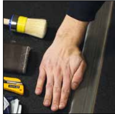
2. Make sure the damaged area is smaller than your hand (max. 100 cm 2 ).