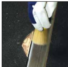
6. Clean away any dust.