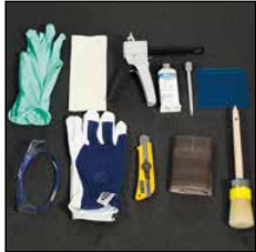
1. Here is all you need.