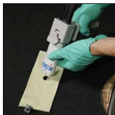
8. Remove the cap, ensure the pistons are working evenly and attach the nozzle.