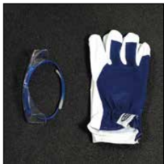
3. Safety first! Prepare yourself for the work with safety goggles.