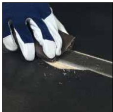
5. Roughen the surface with coarse sandpaper.