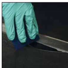
10. Smooth the compound immediately and let it cure for about 60 minutes.

WISA-TopGrip is a solid birch plywood panel with high-friction coating designed for vehicle flooring applications where high friction is needed. It works particularly well in trailers which transport paper rolls and wooden pallets, because it replaces disposable anti-slip mats as friction properties are integrated in the panel.