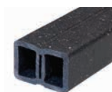
Night Sky Black